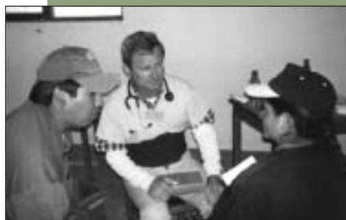
General Medicine patient in Bolivia