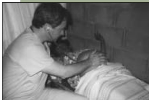
Obstetric patient in Guatemala